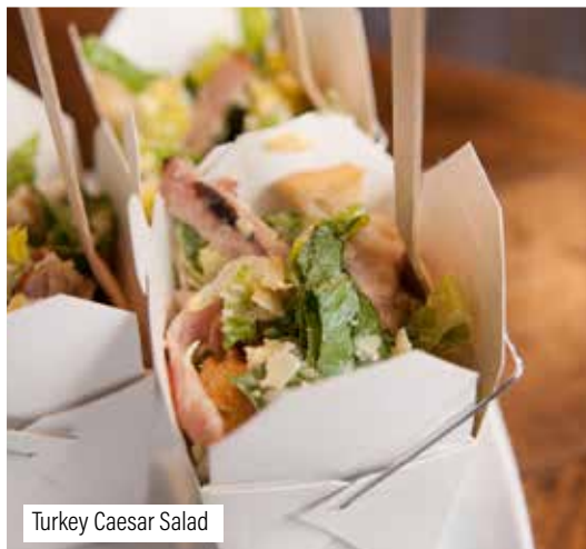
Turkey Caesar Salad