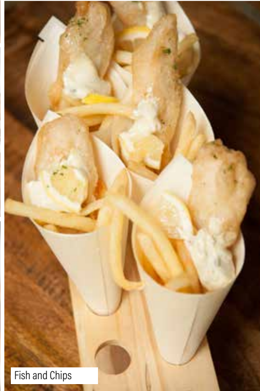
Fish and Chips