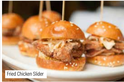
Fried Chicken Slider