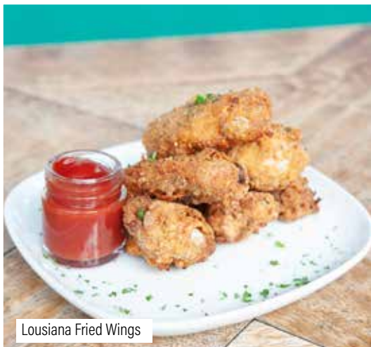
Louisiana Fried Wings