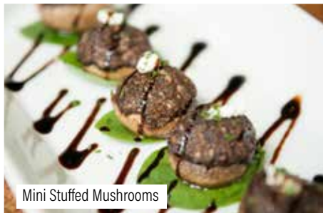
Mini Stuffed Mushrooms