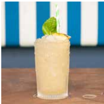
SUMMERS PASSION $20 Vanilla vodka, Frangelico, lemon, pineapple juice, passionfruit puree & topped with ginger beer