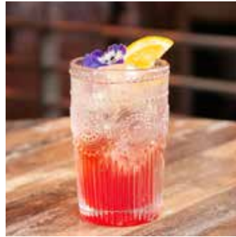
NU GRONI SPRITZ $16 Lyre's Dry London, Lyre's Italian orange, orange syrup & soda water