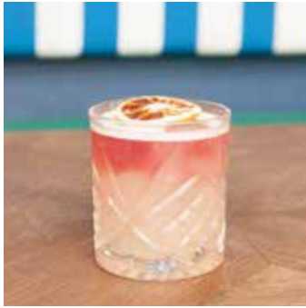
NEW YORK SOUR $20 Bourbon, lemon, sugar and merlot.