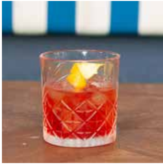
CLASSIC NEGRONI $20 Gin, Campari & Carpano Antica Formula.