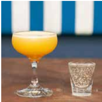
PORNSTAR MARTINI $20 Vodka, Passoa passionfruit liquor, Monin vanilla syrup, passion fruit puree & side shot of T'Gallant prosecco.