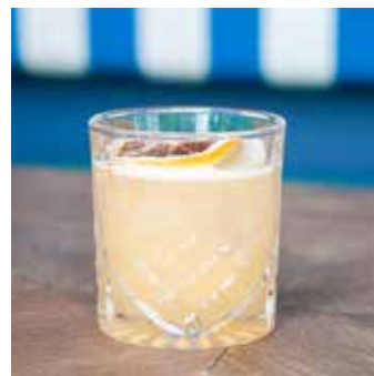
PENICILLIN $20 Blended Scotch, Laphroaig, honey, ginger & lemon juice.