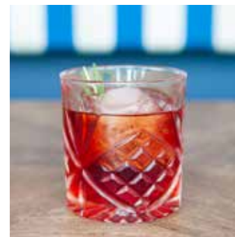
ROSEMARY & CINNAMON RUM NEGRONI $21.5 Rum, Campari, sweet vermouth, cinnamon & rosemary smoke.