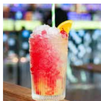
CALIFORNIA LEMONADE $10 Passionfruit puree, American lemonade & grenadine.