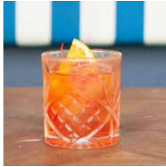
OLD FASHIONED $19.5 Scotch whisky, Angostura bitters & Simple syrup.