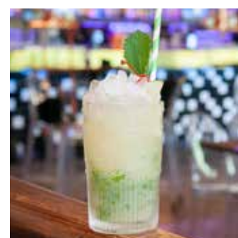
VIRGIN MOJITO $10 Mint leaves, sugar, apple juice, bitters & soda water.