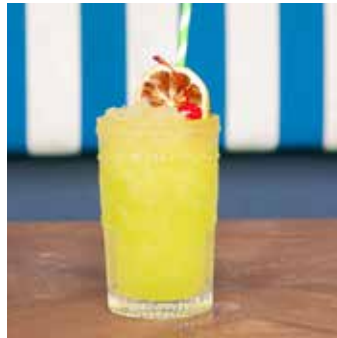
EMERALD ELIXIR $18 Tequila, Midori, lemon juice and lemonade.