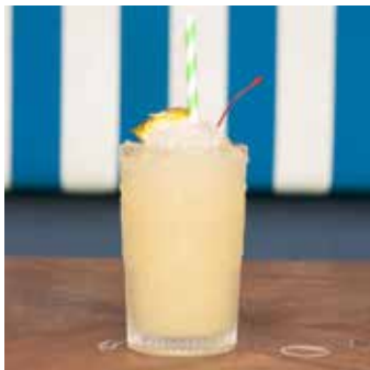
PINA COLADA $20 Coconut rum, pineapple juice, pineapple syrup & lemon juice.