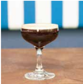
ESPRESSO MARTINI $20 Vodka, coffee liqueur & organic Byron Bay Coffee.