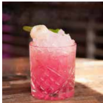
PINK LYCHEE $20 Vodka, Soho lychee, lemon, sugar & raspberry cordial.