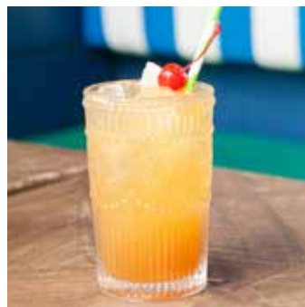
RUMMY $19 Dark rum, Earl Grey Honey, lemon juice & soda.