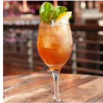
LIGHT & STORMY $17 Lyre's Dark Cane, fresh lime & spiced demerara syrup.