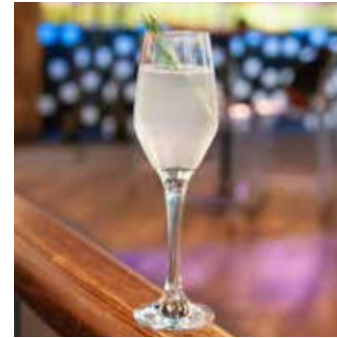
SMOKING MARY $12 Lychee syrup, soda and rosemary.