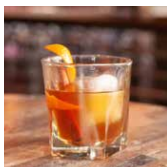
NU FASHIONED $14 Lyre's American malt & spiced demerara syrup.