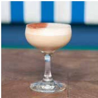
FLAT WHITE ESPRESSO MARTINI $22 Baileys Irish Cream liqueur, vodka & coffee