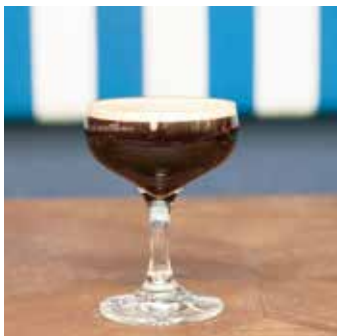
ESPRESSO MARTINI $21 Vodka, coffee liqueur & organic Byron Bay Coffee.