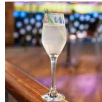
SMOKING MARY $11 Lychee syrup, soda and rosemary.