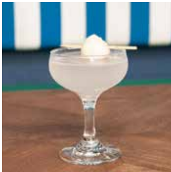
LYCHEE MARTINI $22 Vodka, Soho, Dry Vermouth and sugar syrup.