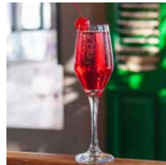
RASPBERRY FIZZ SPRITZ $11 Raspberry syrup and non-alcoholic prosecco.