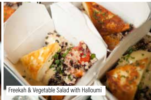
Freekeh & Vegetable Salad with Halloumi