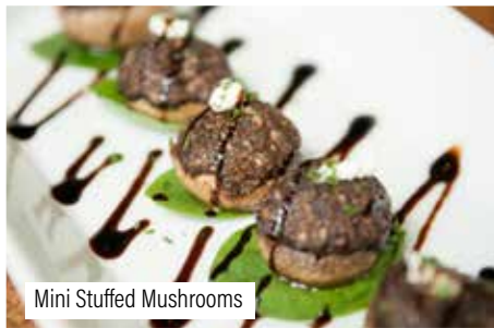
Mini Stuffed Mushrooms