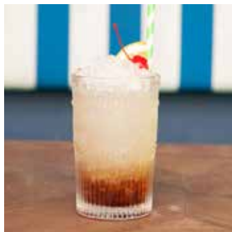
LONG ISLAND ICED TEA $24 Tequila, rum, vodka, gin, cointreau, lemon, sugar & cola.