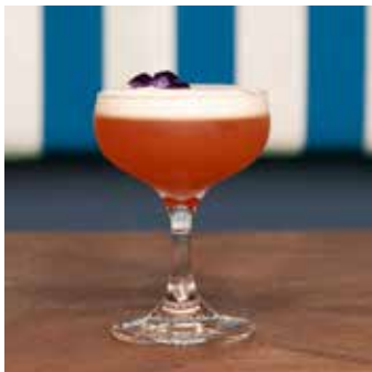
SLOE SOUR $22 Sloe gin, Aperol, Crème de Violette, lemon juice and egg white.