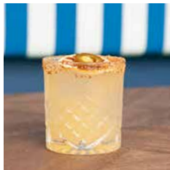
CILANTRO PICANTE $22 Jalapeno & cilantro infused tequila reposado, Cointreau, agave syrup, lime juice and Tobasco sauce.