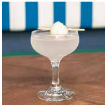
LYCHEE MARTINI $22 Vodka, Soho, Dry Vermouth and sugar syrup.