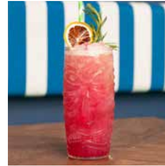
ZOMBIE $27 Dark rum, OP rum, falernum, demerara syrup, lime, Pernod Absinthe, grenadine, pineapple & grapefruit juice. (max of 2 per person)