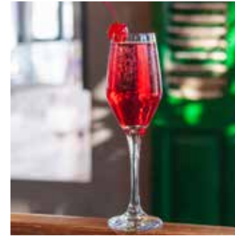
RASPBERRY FIZZ SPRITZ $11 Raspberry syrup and non-alcoholic prosecco.