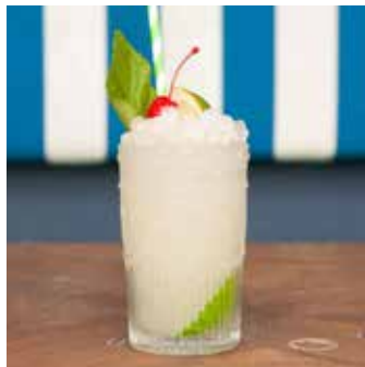
MOJITO $21 White rum, lime juice, simple syrup and mint.