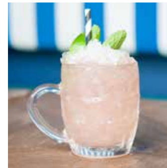
CRANBERRY MOSCOW MULE $20 Vodka, ginger beer, cranberry juice & lime juice.