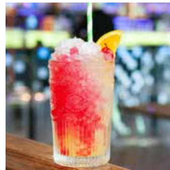
CALIFORNIA LEMONADE $10 Passionfruit puree, American lemonade & grenadine.