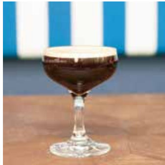
ESPRESSO MARTINI $21 Vodka, coffee liqueur & organic Byron Bay Coffee.