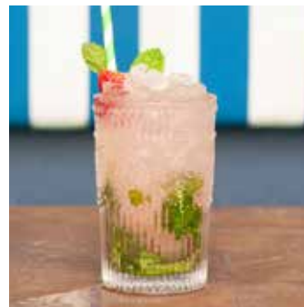
STRAWBERRY MOJITO $21 White rum, lime wedges, lime juice, Monin strawberry puree, mint & splash soda water.