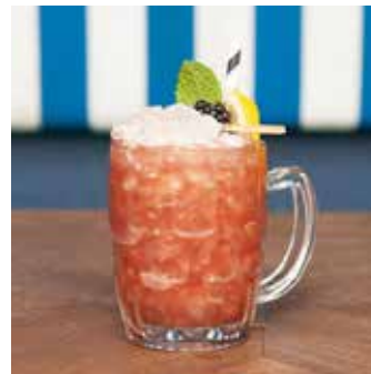
GRANNY'S BLACKBERRY PRESS $21 Crème De Mure, Lemoncello, apple juice, blackberries and mint.