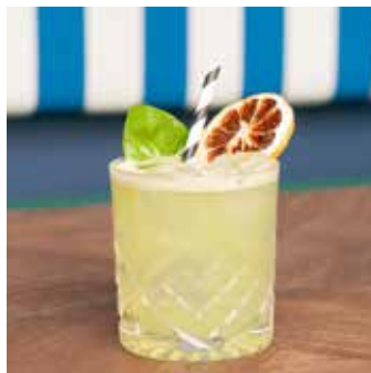
BASIL SMASH $20 Gin, lemon juice, sugar and basil leaves.