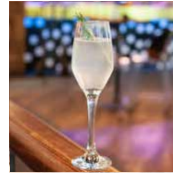
SMOKING MARY $11 Lychee syrup, soda and rosemary.