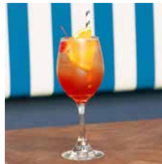
SLOE GIN SPRITZ $19 Sloe gin, fresh lemon juice, sugar syrup & Squealing Pig Prosecco.