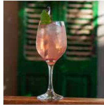
ROSE LEMON SQUEEZE $11 Rose syrup and lemon juice topped up with Not Guilty Rose Spritz