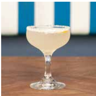
CLASSIC MARGARITA $21 Tequila, Cointreau, lime juice & simple syrup.