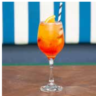
APEROL SPRITZ $17 Equal parts Aperol & prosecco, a dash of soda, ice and a wedge of orange.