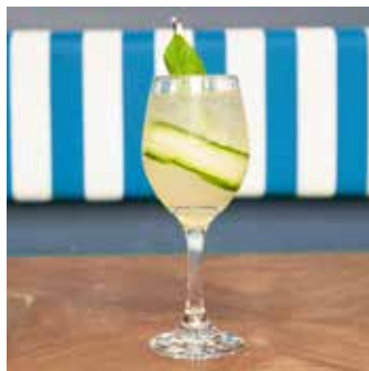
ELDERFLOWER SPRITZ $18 Gin, Elderflower liqueur, lemon juice, soda water & prosecco.