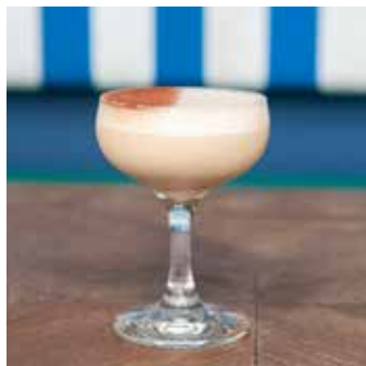
FLAT WHITE ESPRESSO MARTINI $22 Baileys Irish Cream liqueur, vodka & coffee