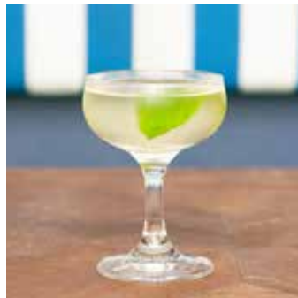
ELDERFLOWER SOUTHSIDE $21 Gin, St Germain Elderflower liqueur, lime juice & mint.