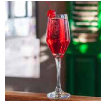
RASPBERRY FIZZ SPRITZ $11 Raspberry syrup and non-alcoholic prosecco.