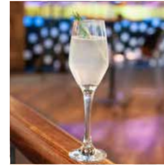
SMOKING MARY $11 Lychee syrup, soda and rosemary.