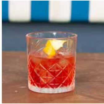
CLASSIC NEGRONI $22 Cin, Campari & Carpano Antica Formula.